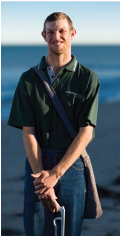
Envirocare, keeping the coastline clean

For more information on Envirocare, contact Toni on 8422 6324.