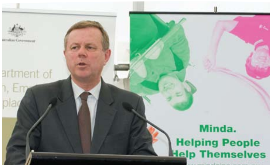
Above: The Premier addresses guests