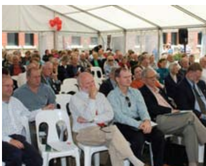
The 2008 AGM