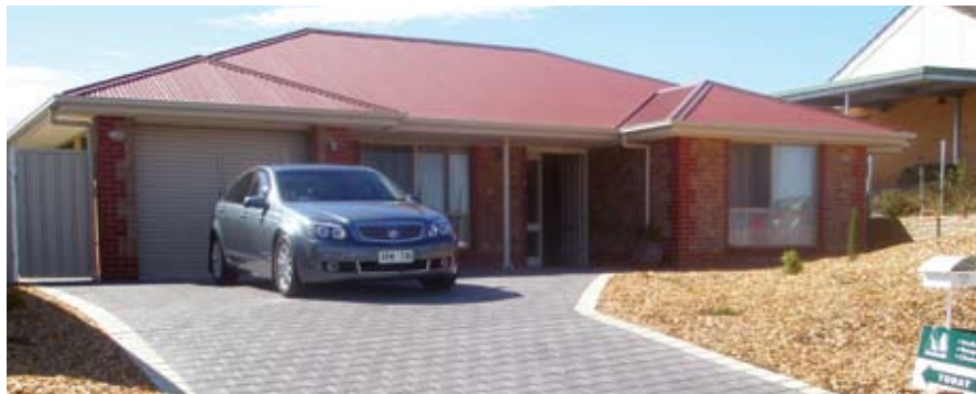
Community accommodation at Hillier Road