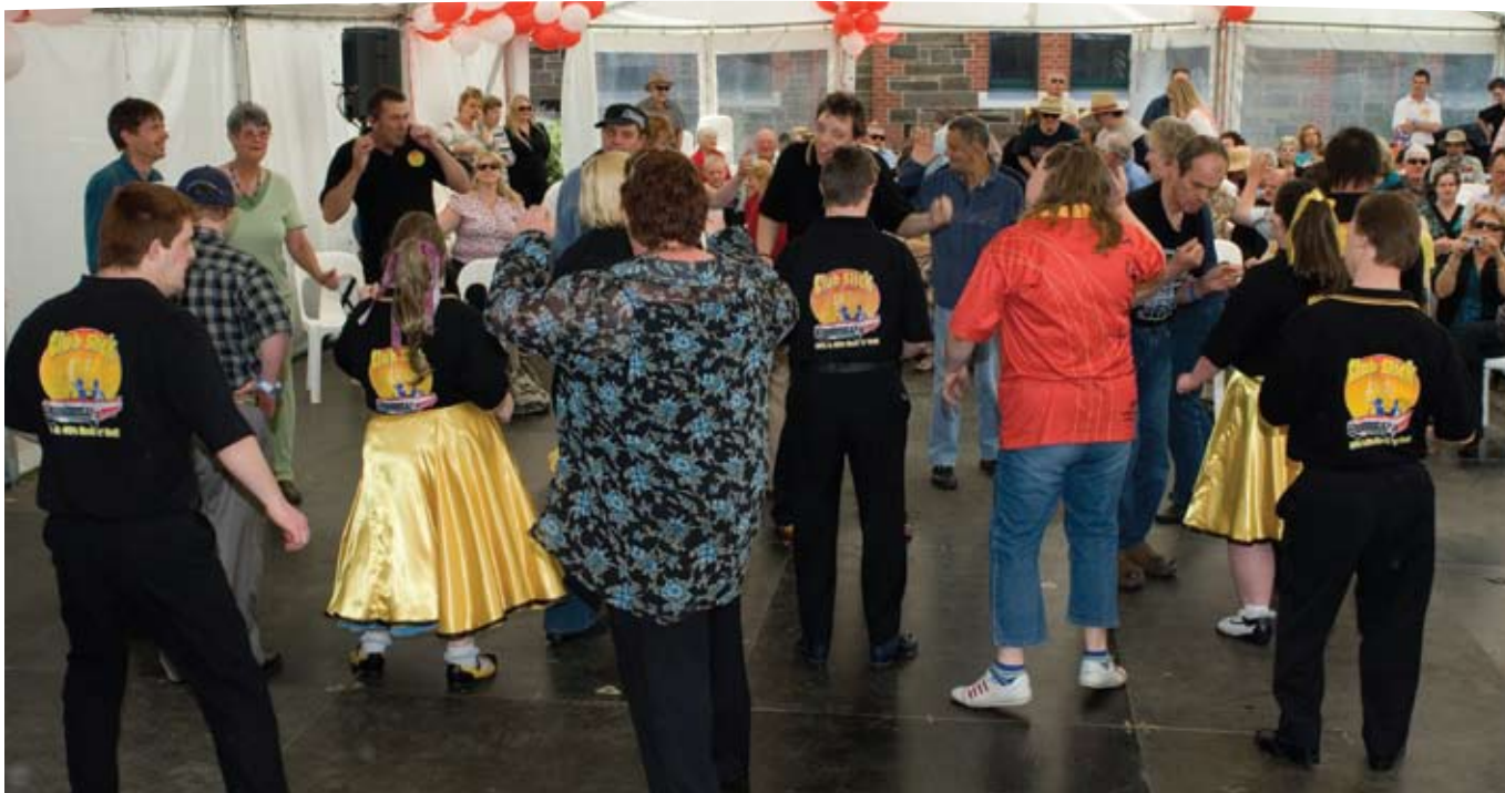
Club Slick encourage BBQ - goers onto the dance floor