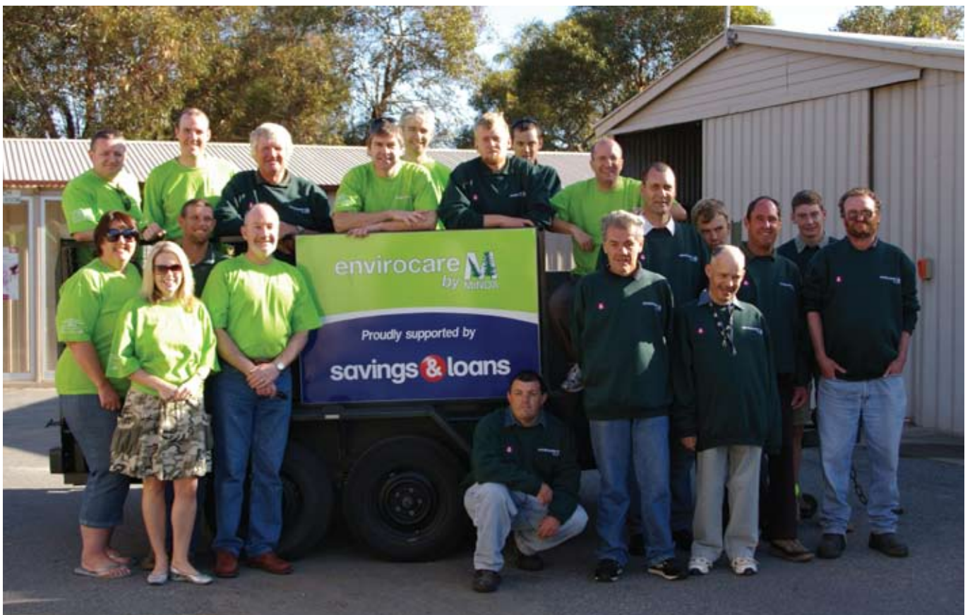
Savings & Loans staff meet the Envirocare crew

Investing in the community is an important part of who Savings and Loans are. Their partnerships focus on giving community organisations the tools they need to make a real difference, and this is exactly what they are doing for Minda's Envirocare team.