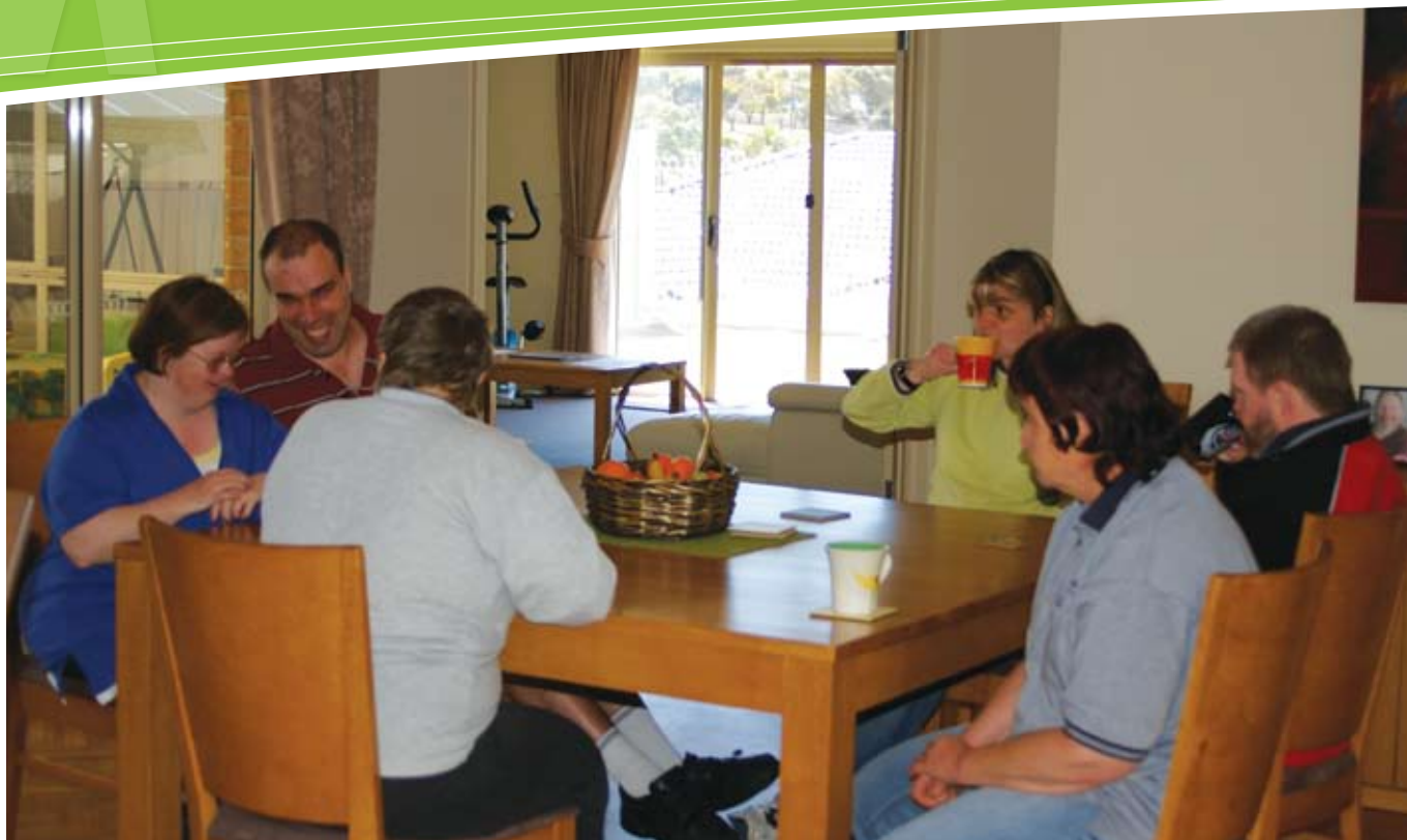
Residents at Hillier Road, Reynella