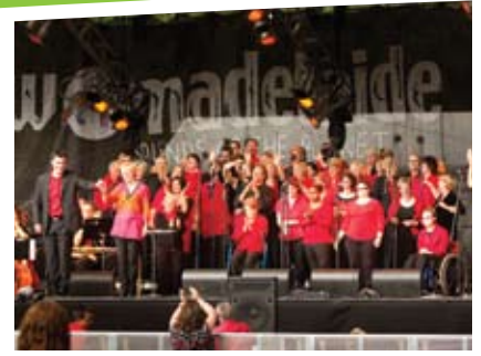
Tutti performing at WOMADelaide